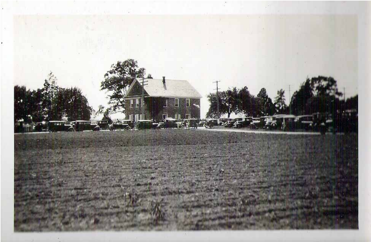
The view from a farmer's field turned parking lot across Main Street